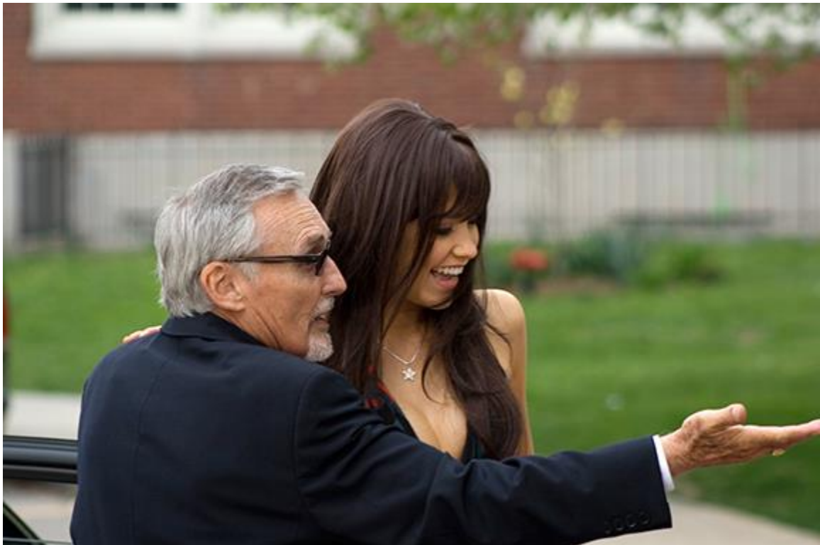
Dennis Hopper and Katrina Bowden