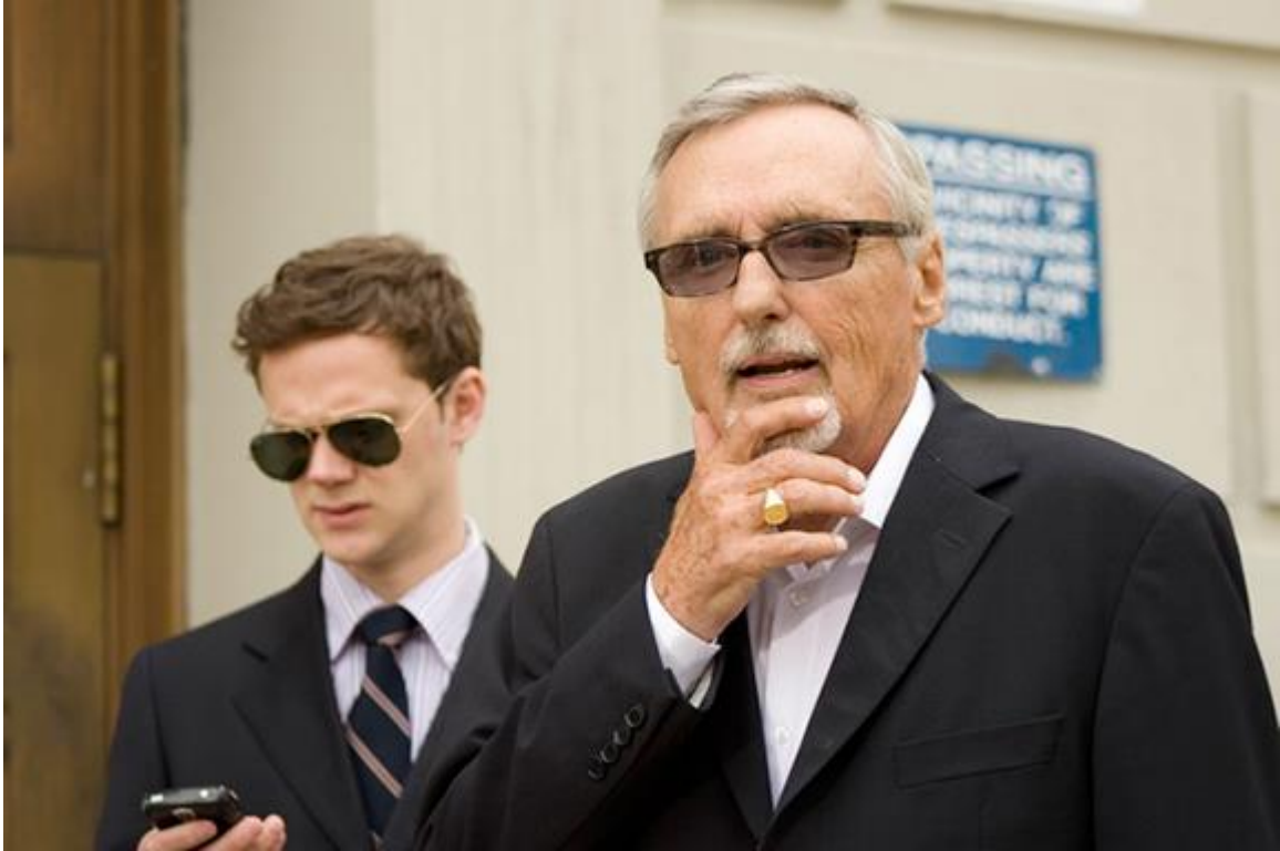
Joseph Cross and Dennis Hopper