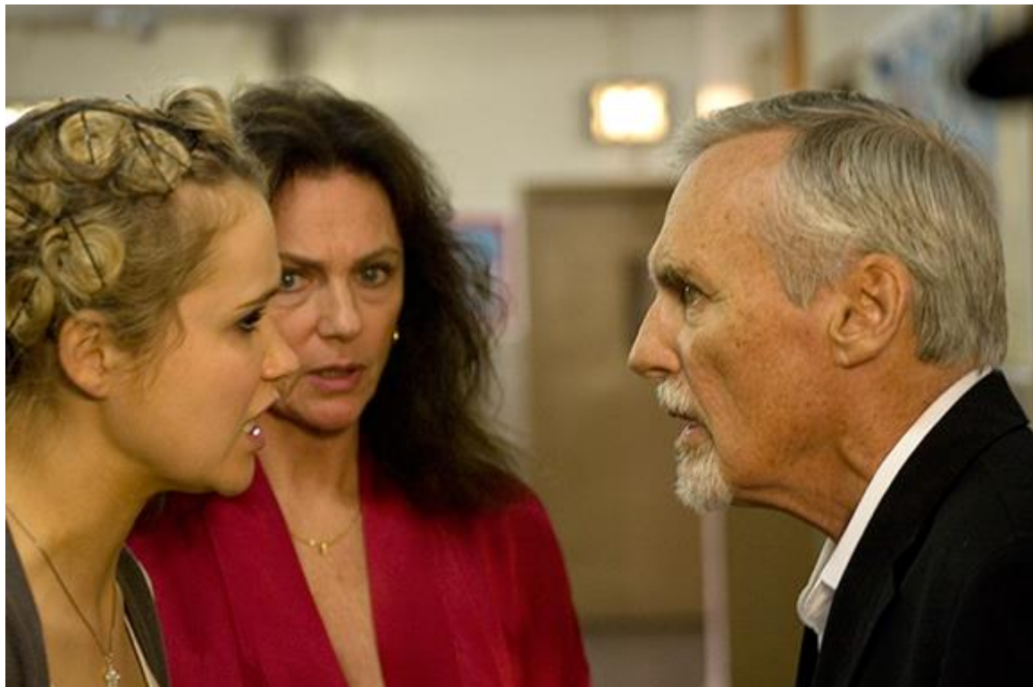
Katrina Bowden, Jacqueline Bisset and Dennis Hopper