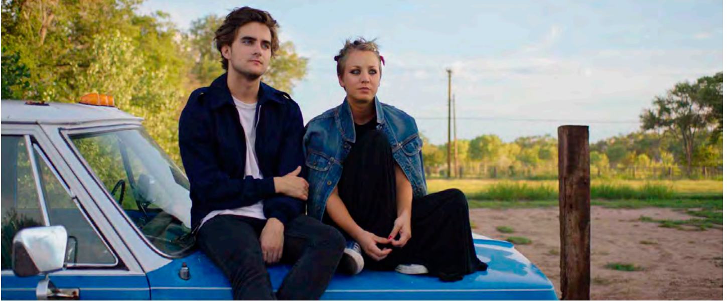
Landon Liboiron /Dylan and Kaley Cuoco /Katy