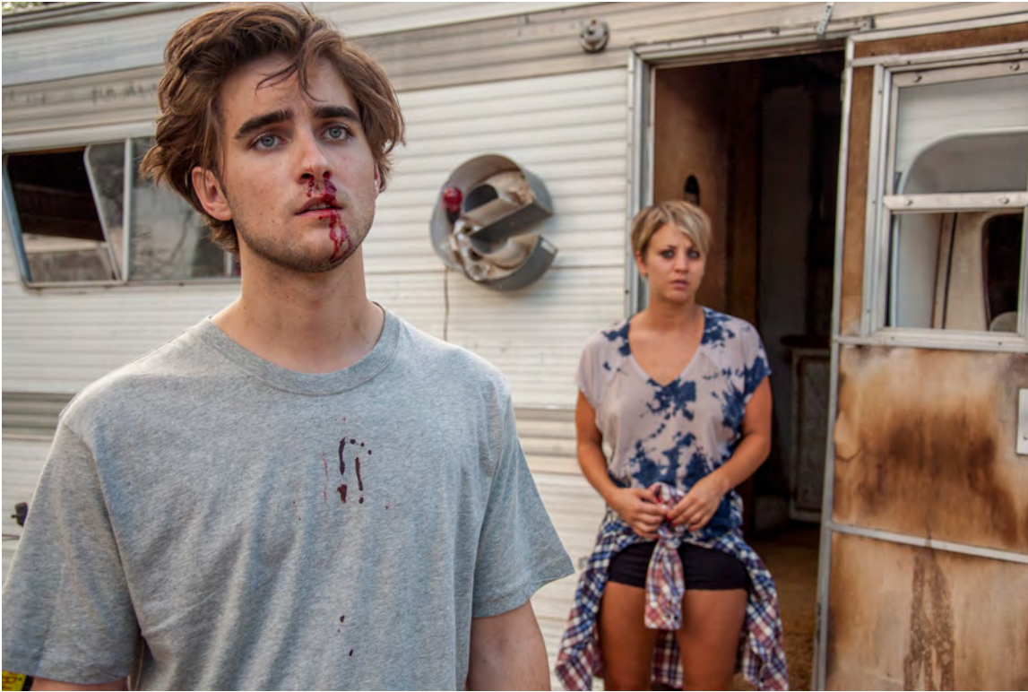
Landon Liboiron /Dylan and Kaley Cuoco /Katy.