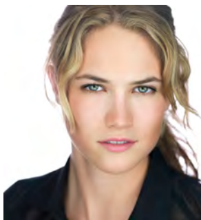
Cody Horn | Ember

Cody Horn can most recently be seen opposite Kaley Cuoco in the upcoming independent feature BURNING BODHI directed by Matthew W. McDuffie. Previously this year, she appeared in James Wan's DEMONIC opposite Maria Bello and Frank Grillo. She also recently shot the independent feature A CHANGE OF HEART directed by Kenny Ortega. In 2012 Cody starred opposite Channing Tatum for director Steven Soderbergh in Warner Bros. MAGIC MIKE as well as Open Road's END OF WATCH opposite Jake Gyllenhaal and Michael Pena for director David Ayer. She has also appeared in the films VIOLET & DAISY for director Geoffrey Fletcher, FLIPPED for director Rob Reiner and TWELVE for director Joel Schumacher. In television she has recurred on THE OFFICE and RESCUE ME .