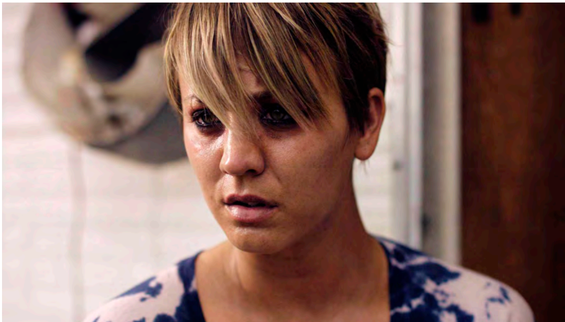
Kaley Cuoco /Katy