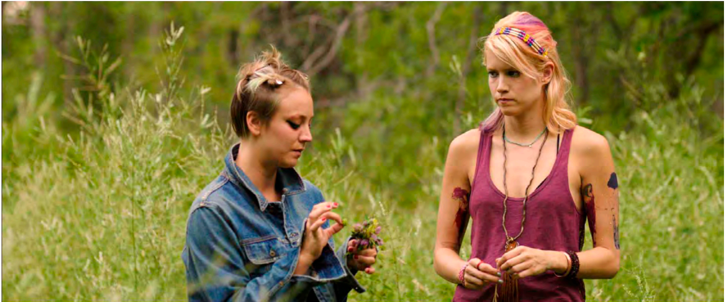
Kaley Cuoco /Katy and Cody Horn /Ember