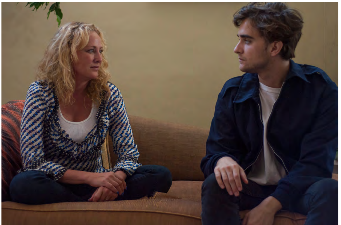
Virginia Madsen /Naomi and Landon Liboiron /Dylan