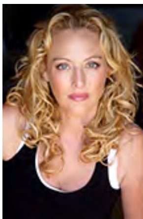
Virginia Madsen | Naomi