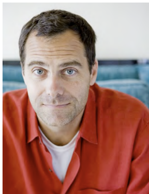
Andy Buckley | Buck

Thanks to the lucky break of getting cast as David Wallace on NBC's 'THE OFFICE' 10 years ago, Andy has been working steadily for the past decade. Most recently, he played Scott Mitchell, father of the 2 main boys in this year's biggest movie, Jurassic World. He recently wrapped a big supporting role in New Line's 'Untitled Will Ferrell/Amy Pohler' movie - formerly titled 'The House.'